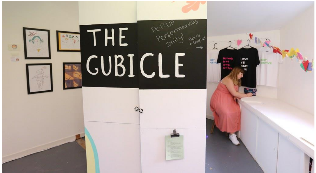
The Cubicle installed in a shop in Bath city centre

The Cubicle: Changing Rooms, Changing Views