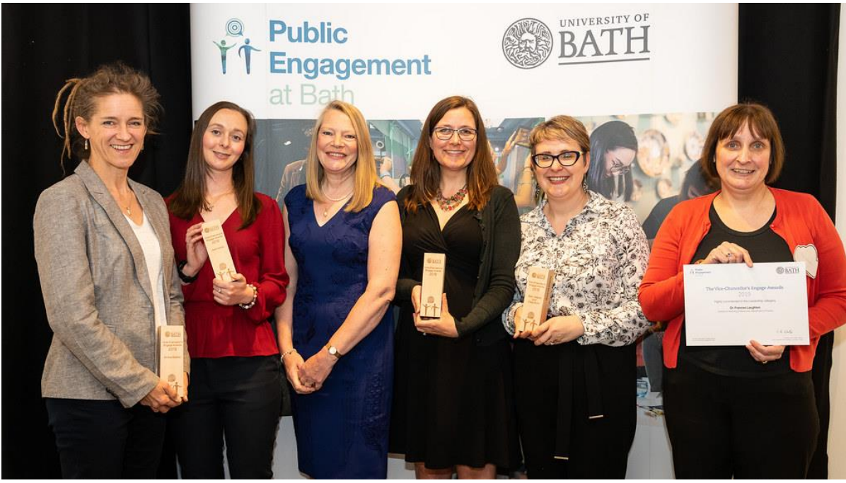
Winners of the Vice-Chancellor's Engage Awards

Working closely with researchers from across the University has been an important part of our approach to building and sustaining institutional capacity for public engagement with research. This work has taken many forms such as showcasing their practice at our training seminars and workshops, celebrating their achievements through the Vice-Chancellor's Engage Awards, offering advice and guidance on engagement activities for grant proposals and supporting applications to external bodies that rewards and recognises their engagement work. We have compiled a rich library of case studies of <u>engaged researchers</u> and <u>engagement stories</u> from right across the University. The below are just a taster of a community of engaged researchers that continues to grow each year.