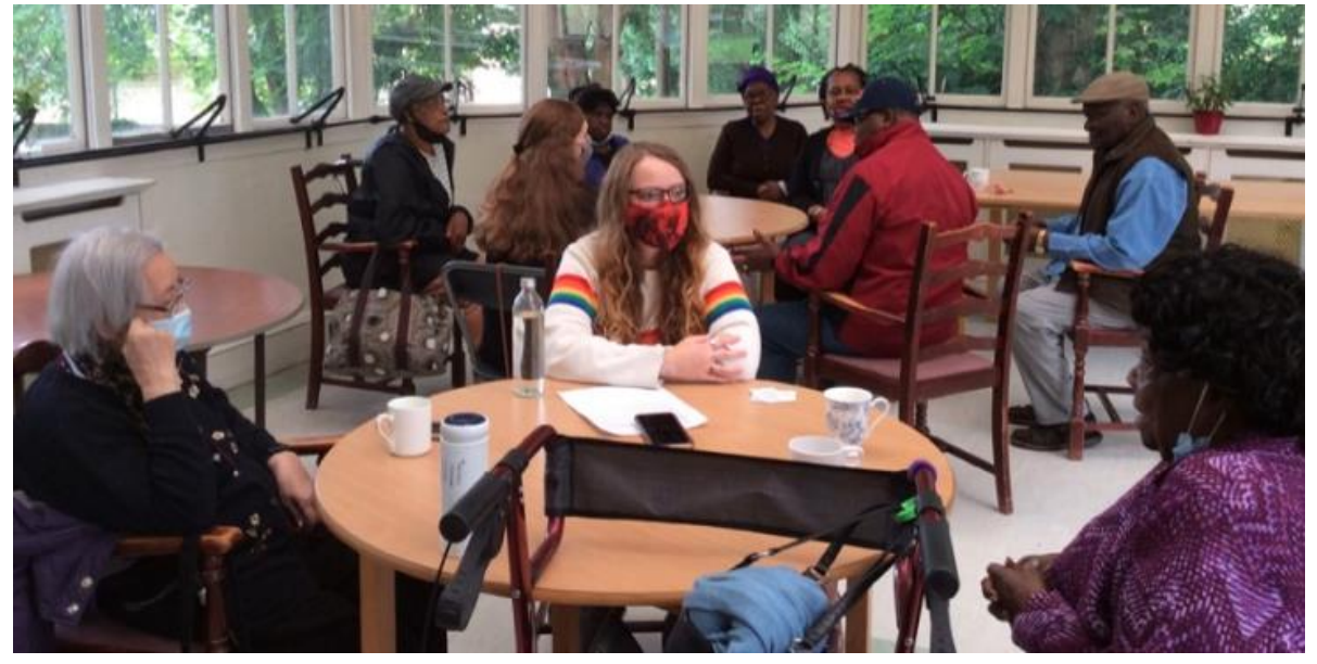
Researchers from the Healthy Later Living Network engaging older people at a community venue

Bringing older adult's experience of ageing into research is at the heart of The Listening Project . Working with a range of community groups like the Bath Ethnic Minority Senior Citizen Association, the project is a series of informal conversations between researchers from several disciplines in the Healthy Later Living network and older adults. With the broad themes of mental and physical health, there is no set agenda to these conversations other than to create an environment that allows everyone's voice and opinion to be heard. By taking this approach the researchers aim to use this insight to help inform the network's research priorities.