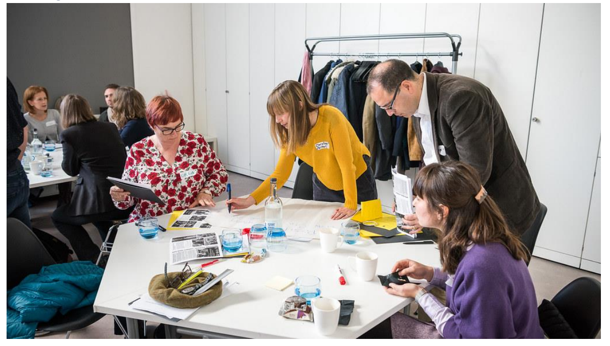
Participants taking part in a training session run by the Public Engagement Unit

In 2017 we were awarded £78,000 from UKRI to investigate the provision, uptake and impact of training and professional development opportunities for researchers in public engagement as part of the Strategic Support to Expedite Embedding Public Engagement with Research call. Over the course of the two years of <u>ChallengeCPD@Bath</u> we used the opportunity to radically rethink our professional development programme, which included creating an online learning tool, the Public Engagement Knowledge Hub, experimenting with researchers to co-produce training and developing skills self-assessment toolkits, better reflecting the needs and interests of our researchers. We used this funding opportunity to also maintain the University's position at the forefront of public engagement thinking and practice by sharing our findings through national and international conferences, in publications including blogs and peer reviewed journals and at workshops for peers.